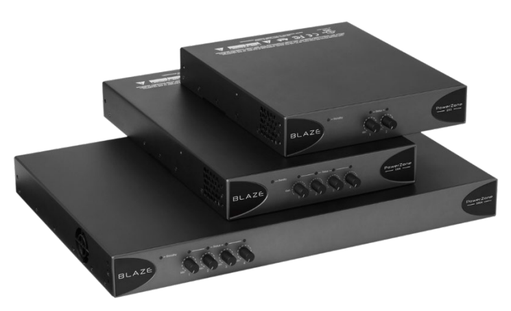
2/4 Channel Install Power Amplifiers